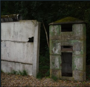
Remains of the inner German border wall in Rade

Scientific research is not only about gaining insight, it is also about crossing borders: In science, people of all nationalities come together to push against the boundaries of the current state of knowledge. In the process, they often overcome geographical as well as mental barriers. Traditionally, the concept of the border has been closely linked with geography and topography, but also philosophers and mathematicians have developed concepts of the border. Nowadays, borders can have geographical, political, historical, ethical, as well as psychological implications. They should not only be seen as barriers, however, but also as potential points of contact.