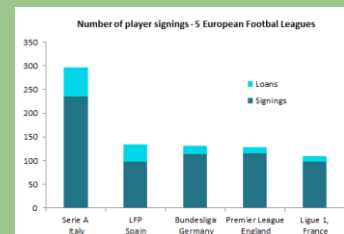
Number of transfers (player signing 2012/2013) according to data for from Prime Time Sport

All PhD students of ENLIGHT-TEN moved to new country.