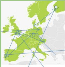
Visualisation of relocation of ENLIGHT-TEN PhD students